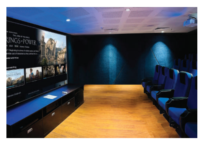
A 25 - Seater Movie Theatre that plays international and Indian movies through the day

A game room with a wide range of board & video games